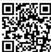
User Manual of e-Request